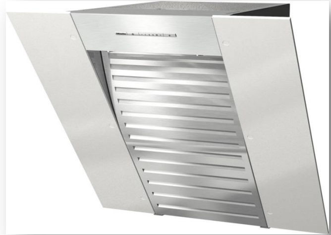
e.g. DA 6066 White Wing