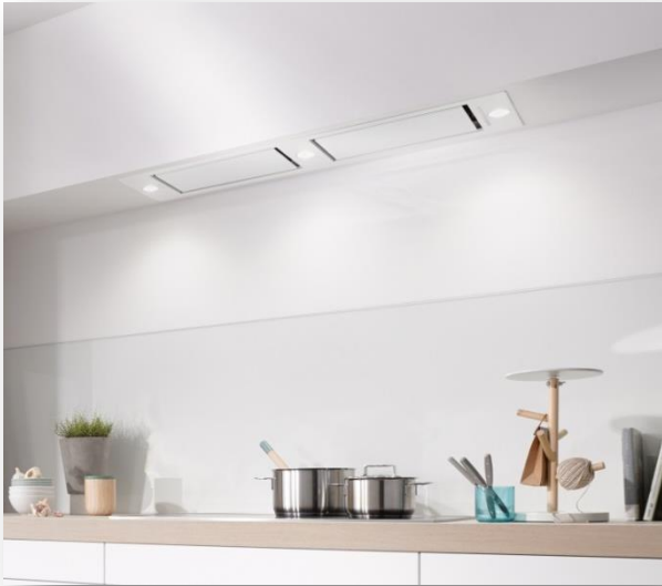
e.g. DA 2620 extractor unit