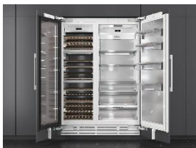
Photo 2: iF Gold Award 2019 for the MasterCool series from Miele. The jury showed itself impressed by Miele's dedication to detail. (Photo: Miele)

Photo 1: iF Gold Award 2019 for Miele's G 7965 SCVi dishwasher. The jury was impressed by the product's 'excellent overall quality' and the unique AutoDos dispensing system with PowerDisk. (Photo: Miele)