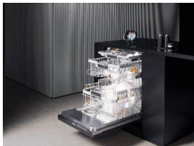
Photo 1: iF Gold Award 2019 for Miele's G 7965 SCVi dishwasher. The jury was impressed by the product's 'excellent overall quality' and the unique AutoDos dispensing system with PowerDisk.