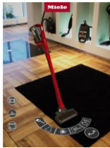
Photo 4: The product benefits of the new Triflex rechargeable handstick vacuum cleaner will be showcased at the IFA trade show in combination with an augmented reality application. (Photo: Miele)

Text and photo download: www.miele-presse.de