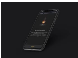
Photo 2: The BaristaAssistant from Miele guides coffee aficionados through to creating their own favourite espresso. (Photo: Miele)

Photo 1: The Miele@mobile app shows how long it is possible to add laundry to a programme that is already running. (Photo: Miele)