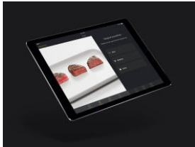
Photo 3: English, medium or well done – the CookAssist application in conjunction with TempControl induction hobs from Miele help in frying a perfect steak.