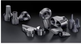
Photo 1: Useful accessories for home printing: With the launch of 3D4U, Miele is offering an initial range comprising ten objects. (Photo: Miele),