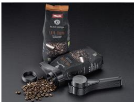
Photo 4: The 3D4U coffee clip keeps coffee beans in already opened bags fresh for longer. (Photo: Miele)

Photo 3: Thanks to the 3D4U valuables separator, valuables are held back and do not land in the dust bag together with dirt. (Photo: Miele)