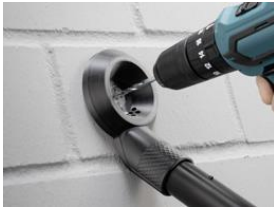
Photo 2: A hands-free and streamlined attachment for cleaning bore holes makes working with a drill simple and convenient. (Photo: Miele)

Photo 1: Useful accessories for home printing: With the launch of 3D4U, Miele is offering an initial range comprising ten objects. (Photo: Miele),