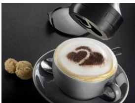
Photo 5: Motifs for the 3D4U motif dispenser are easily customised. (Photo: Miele)

Photo 4: The 3D4U coffee clip keeps coffee beans in already opened bags fresh for longer. (Photo: Miele)