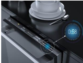
Photo 1: The proven QuickPowerWash function and compatible Miele UltraTabs All in 1 get dishes and cutlery clean in just 58 minutes.

There are three photographs with this text