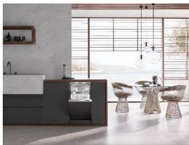
Photo 2: The new G 5000 SL 45 cm dishwashers deliver appealing features that ensure maximum convenience in a small package: these include BrilliantLight illumination in the fully integrated G 5890 SCVi model.