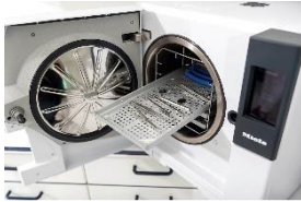
Photo 1: Ample space for trays, containers and cartridges is offered by the new holders for use in Miele Cube and Cube X small sterilisers.

There are two photographs with this text