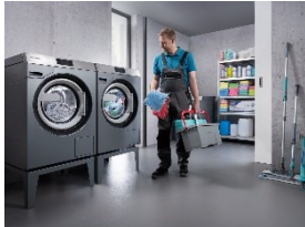
Photo 1: Easy to operate and connectivity-enabled: Washing machines with load capacities starting from 9 kg from 'The New Benchmark Machines'.

There are two photographs with this text