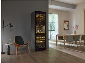
Photo 1: KWT 4999 F obsw – An eyecatcher for discerning wine connoisseurs: A wine conditioning unit from Miele with three independently selectable temperature zones and individually selectable humidity (ActiveHumidity) as well as a SommelierSet for presenting and decanting fine wines.

There are six photographs with this text