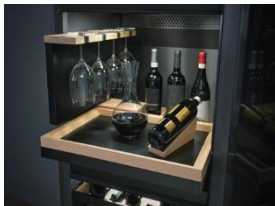
Photo 2: For the presentation of choice wines in great style: Miele's unique SommelierSet. Here, even opened bottles can be safely stored. The tray is removable and has a non-slip mat. (Photo: Miele)

Photo 1: KWT 4999 F obsw – An eyecatcher for discerning wine connoisseurs: A wine conditioning unit from Miele with three independently selectable temperature zones and individually selectable humidity (ActiveHumidity) as well as a SommelierSet for presenting and decanting fine wines. (Photo: Miele)