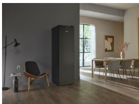
Photo 4: KWT 4584 E sw – The new wine storage unit from Miele offers ample space and a temperature zone ideal for wine storage in cellars or pantries. It is able to accommodate an astonishing 229 bottles. (Photo: Miele)

Photo 3: PresenterFrame: Storage or presentation of fine wines, showcased even better thanks to individually selectable lighting. This even allows opened bottles to be stored. (Photo: Miele)