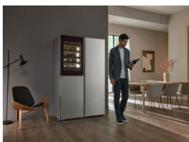
Photo 6: Side by side: Wine-freezer combination and refrigerator from Miele are a source of great pleasure. The wine conditioning unit offers space for 44 bottles of select wine. (Photo: Miele)

Photo 5: The new generation of wine units from Miele sports innovative features: Particularly low-vibration and hence quiet storage, UV protection and individually selectable humidity (ActiveHumidity). (Photo: Miele)