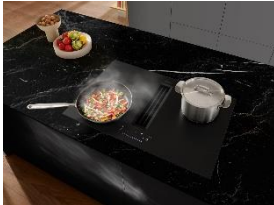
Photo 2: The TwoInOne (KMDA 7876 FL) induction hob with integrated extraction in MattFinish is elegant in terms of both look and feel as well as being impervious to scratches. A further benefit of a structured surface is the anti-fingerprint effect which means fingerprints are hardly visible. On top, 125 Gala Edition products come with a free 125-week extended warranty.