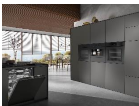
Photo 1: To mark its 125th. birthday, Miele is presenting its handleless ArtLine series as well as induction hobs and cooker hoods in a noble obsidian black matt. On the occasion of its anniversary, the company is offering a free 125-week extended warranty with these products – in addition to the statutory Miele guarantee.