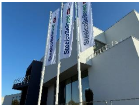
Photo 3: External view of the new internal academy at SteelcoBelimed, where more than 1,000 training sessions will take place each year. (Photo: SteelcoBelimed)

Photo 2: Aerial view of the training academy in Riese Pio X, Italy, which also includes a 230-square-metre auditorium. (Photo: SteelcoBelimed)