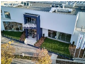
Photo 2: Aerial view of the training academy in Riese Pio X, Italy, which also includes a 230-square-metre auditorium. (Photo: SteelcoBelimed)

Photo 1: Grand opening: Alessandro Caprara, CEO Infection Control, Ombretta Basso, Mayor of Riese Pio X and CEO Christian Kluge (from left) cut the red ribbon in front of the new training academy. (Photo: SteelcoBelimed)