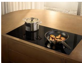
Photo 3: Smart, stylish, flexible: The new KM 8000 hobs offer maximum freedom and generous space for cooking. The intelligent system, consisting of KM 8000 induction hob and M Sense cookware with up to three temperature sensors, automatically regulates temperature and power so nothing burns or boils over. (Photo: Miele)

Photo 2: At Milan Design Week 2026, Miele presents its latest product innovations within an immersive exhibition stand that integrates appliances into connected, real-life usage scenarios, making their interaction and everyday relevance tangible. (Photo: Miele)