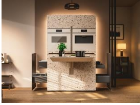
Photo 5: With 'Miele Compact Living: Kitchen Unit powered by Hettich', Miele presents a design study for highly functional and flexible kitchen solutions in even the smallest spaces. By combining appliances with adaptable furniture systems, the concept addresses the growing demand for efficient urban living without compromising on performance or design.