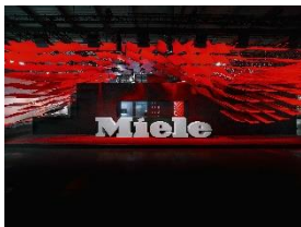
Photo 1: At Milan Design Week 2026, Miele’s exhibition stand brings the “Designed to Move with You” concept to life as an open, dynamic living space that adapts to users’ daily routines while seamlessly connecting physical and digital elements into an intuitive overall experience.