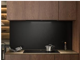
Photo 7: The integrated glass panel hood DAG 2950 is virtually invisible when closed, concealed within the wall cabinet; during cooking, the panel flips up, allowing for direct operation and providing additional protection for the cabinet body against rising steam. (Photo: Miele)

Photo 6: The 60-cm KMDA 5649 cooktop with integrated extractor combines steam extraction directly into the cooking surface, eliminating the need for a separate range hood – for a calm, open kitchen design without visual interruptions. (Photo: Miele)