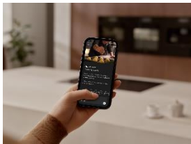
Photo 8: With the CulinaryCoach, Miele presents an AI-powered assistant that provides personalised cooking guidance in real time, seamlessly connecting users with their appliances and making everyday cooking more intuitive and adaptable. (Photo: Miele)

Photo 7: The integrated glass panel hood DAG 2950 is virtually invisible when closed, concealed within the wall cabinet; during cooking, the panel flips up, allowing for direct operation and providing additional protection for the cabinet body against rising steam. (Photo: Miele)