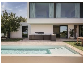
Photo 9: With Outdoor Cooking, Miele introduces a modular outdoor kitchen system with modules and accessories that can be combined to suit different spaces, needs and lifestyles. (Photo: Miele)

Photo 8: With the CulinaryCoach, Miele presents an AI-powered assistant that provides personalised cooking guidance in real time, seamlessly connecting users with their appliances and making everyday cooking more intuitive and adaptable. (Photo: Miele)