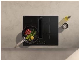
Photo 6: The 60-cm KMDA 5649 cooktop with integrated extractor combines steam extraction directly into the cooking surface, eliminating the need for a separate range hood – for a calm, open kitchen design without visual interruptions. (Photo: Miele)

Photo 5: With 'Miele Compact Living: Kitchen Unit powered by Hettich', Miele presents a design study for highly functional and flexible kitchen solutions in even the smallest spaces. By combining appliances with adaptable furniture systems, the concept addresses the growing demand for efficient urban living without compromising on performance or design. (Photo: Miele)