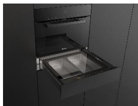
Photo 4: The new Miele steam drawer, when combined with a 45 cm compact oven with microwave in a 60 cm niche, forms a space-saving 3in1 solution for baking, reheating and steam cooking, with two separate steam cooking containers for preparing different food at the same time. Coming March 2027. (Photo: Miele)

Photo 3: Smart, stylish, flexible: The new KM 8000 hobs offer maximum freedom and generous space for cooking. The intelligent system, consisting of KM 8000 induction hob and M Sense cookware with up to three temperature sensors, automatically regulates temperature and power so nothing burns or boils over. (Photo: Miele)